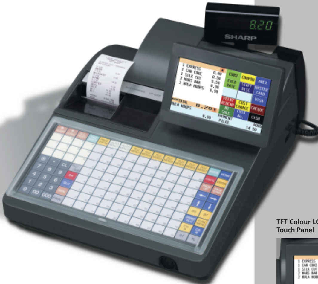
TFT Colour LCD Display with Touch Panel